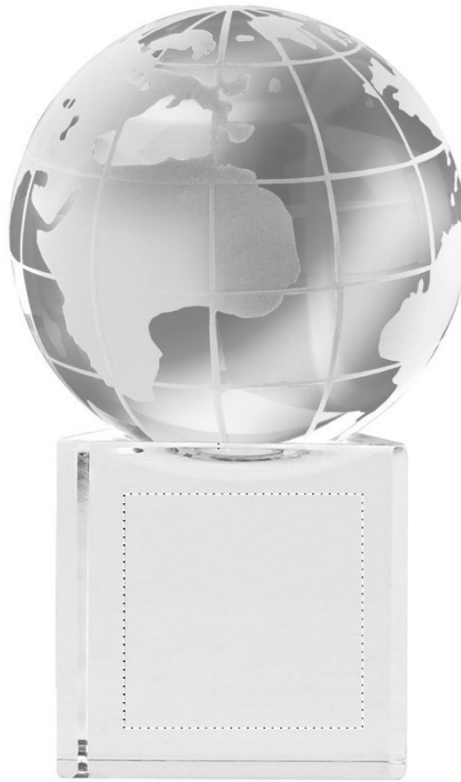
2. BASE BACK